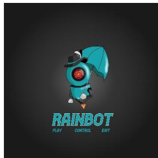
RAIN_BOT DEVELOPER, CTO