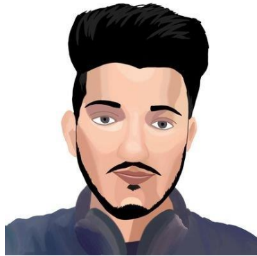
ABHISAAR ADVISOR, CXO