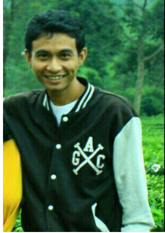
SUIZEN ADMIN, CIO