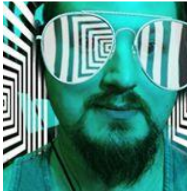
CHEVIX CONTENT CREATOR, EDITOR