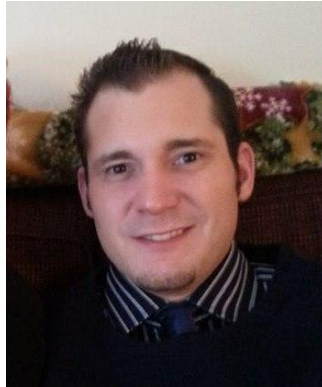
NERO FOUNDER, CEO